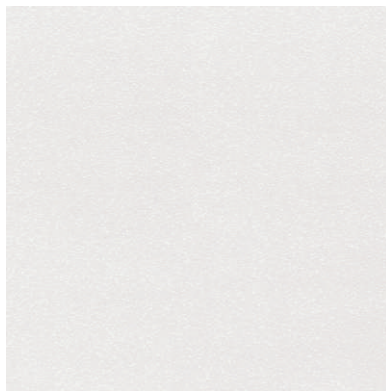
Galaxy Pro EC Gris