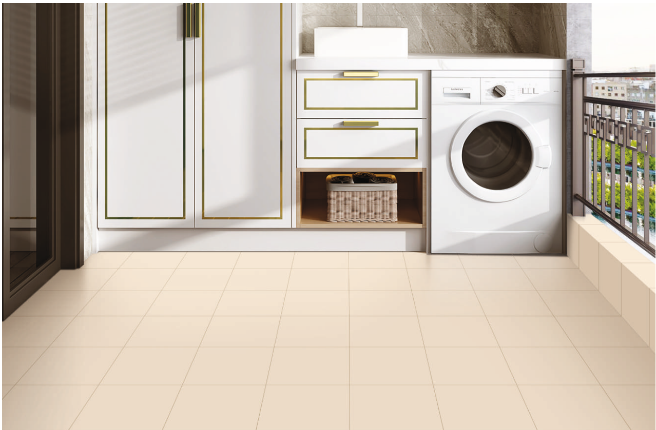
Moon Pro EC Beige