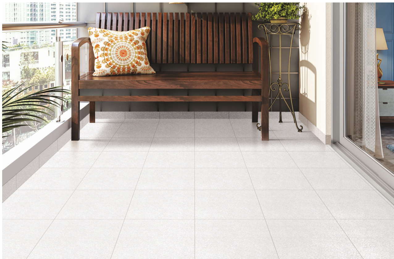
Galaxy Pro EC Gris