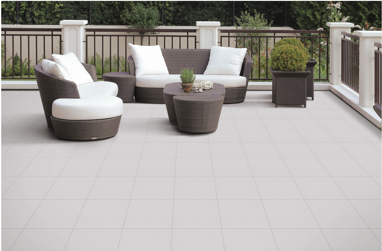
Plain Pro EC Grey