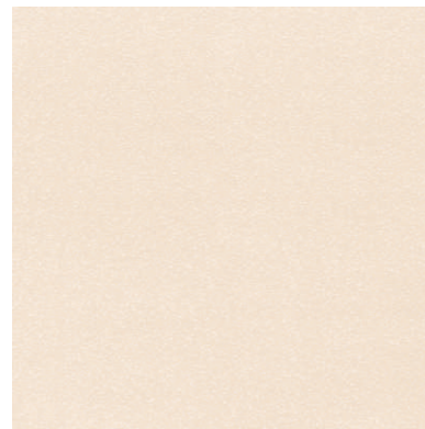
Galaxy Pro EC Beige