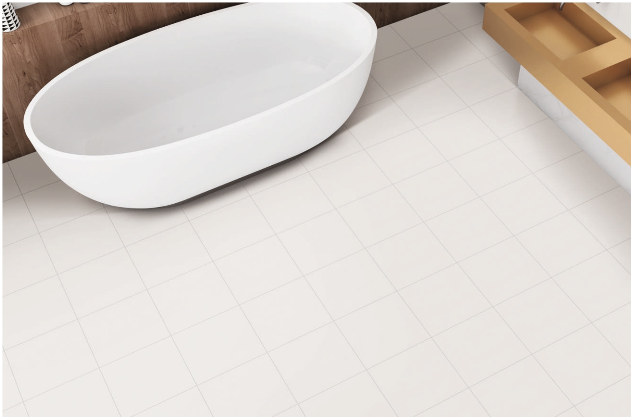
Plain Pro EC Silver