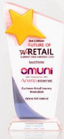
Customer Retail Journey Innovation Winners Future of Retail Summit & Awards 2020