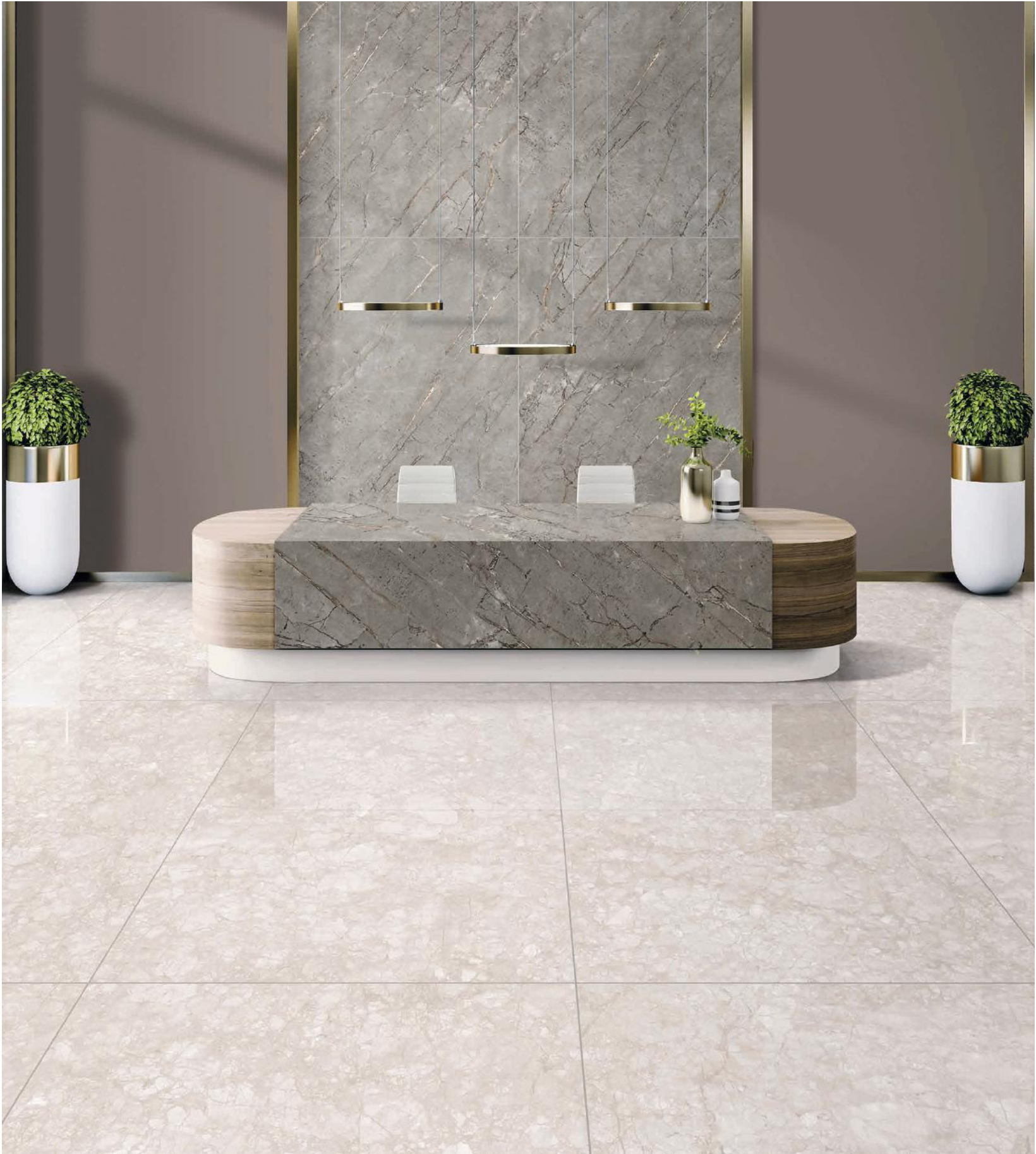
Preview Shown: PGVT VENISTONE GREY & CARVING SONATA MARBLE GREY