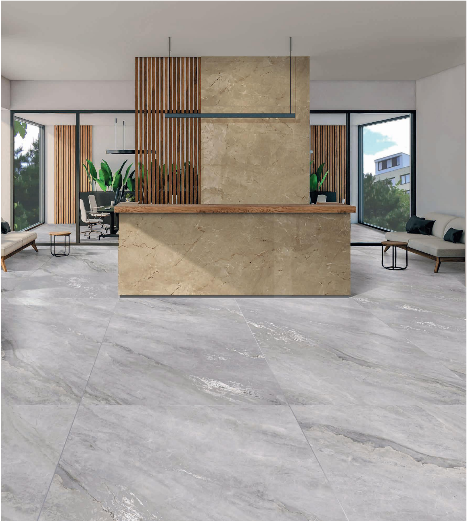
Preview Shown: CARVING QUARTZITE GREY & SUPER GLOSS GRIGIO BEIGE