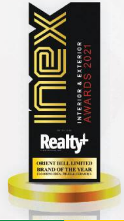
Brand of The Year 2021 (Flooring Idea-Tiles & Ceramic)