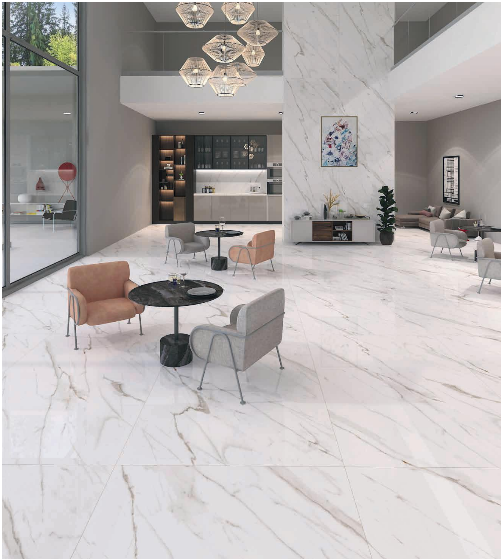
Preview Shown: PGVT CALACATTA MARBLE