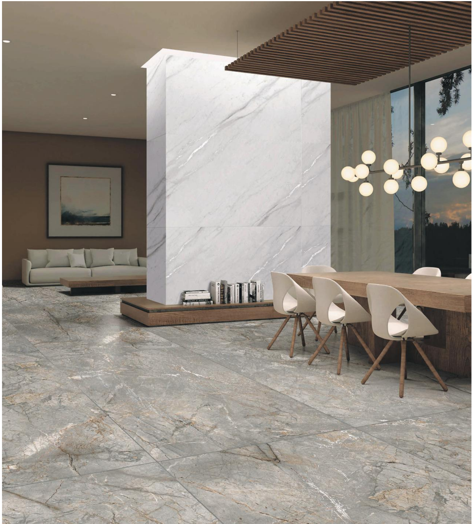
Preview Shown: CARVING SILVER ROOT & CARVING CARRARA MARBLE