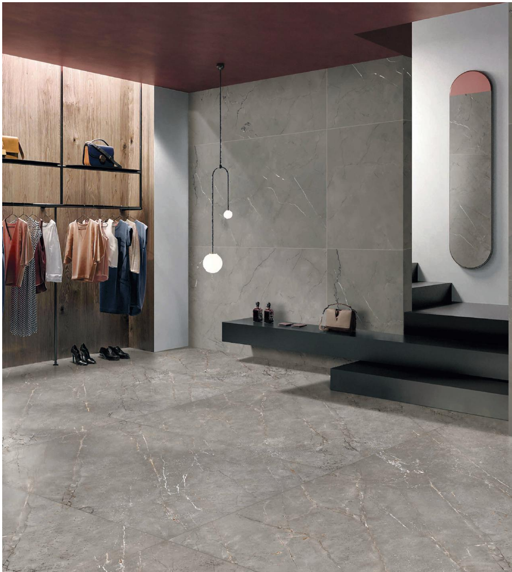
Preview Shown: CARVING SONATA MARBLE GREY & SUPER GLOSS ESSENZIALE GREY