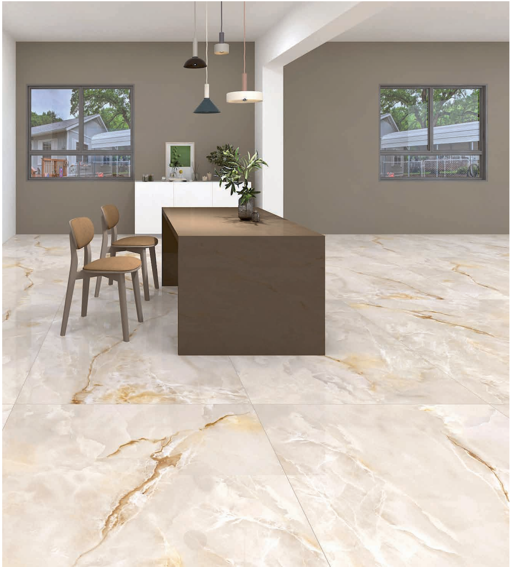
Preview Shown: SUPER GLOSS ONYX MARBLE PEARL