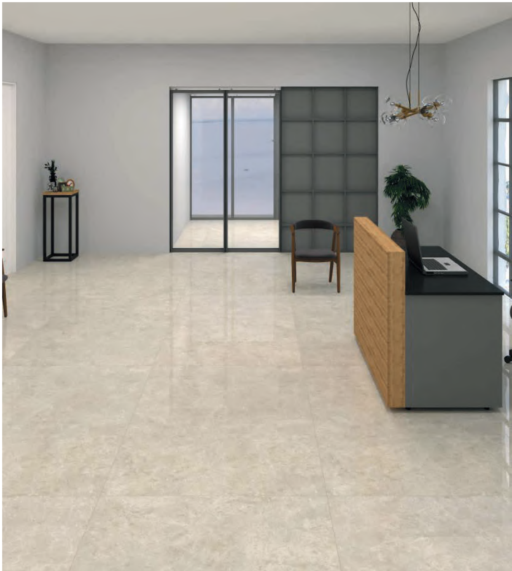
Preview Shown: SUPER GLOSS EMPERADOR BIANCO LT