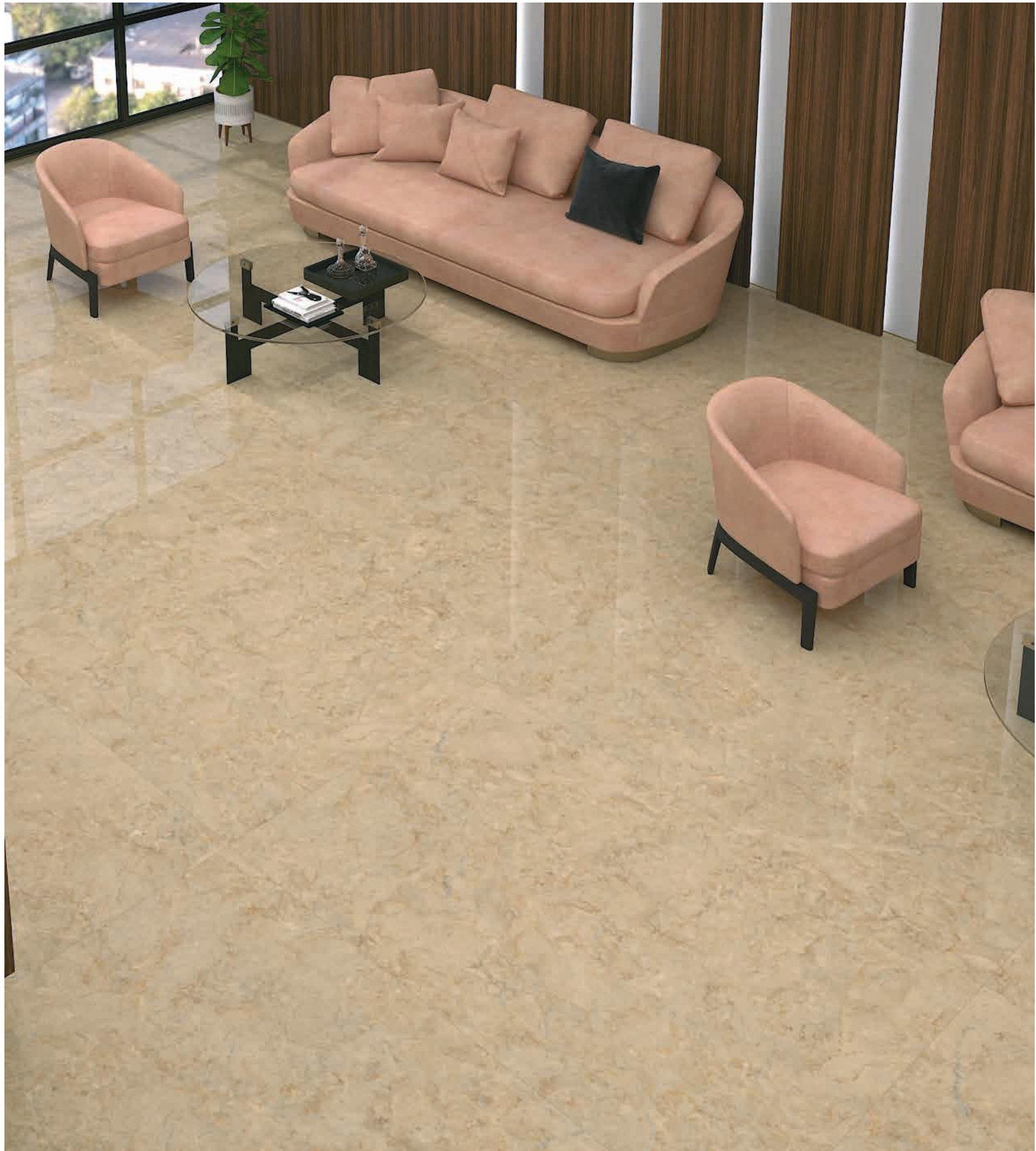
Preview Shown: SUPER GLOSS EMPRO BEIGE LT