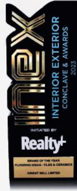
Brand of The Year 2023 (Flooring Idea-Tiles & Ceramic)