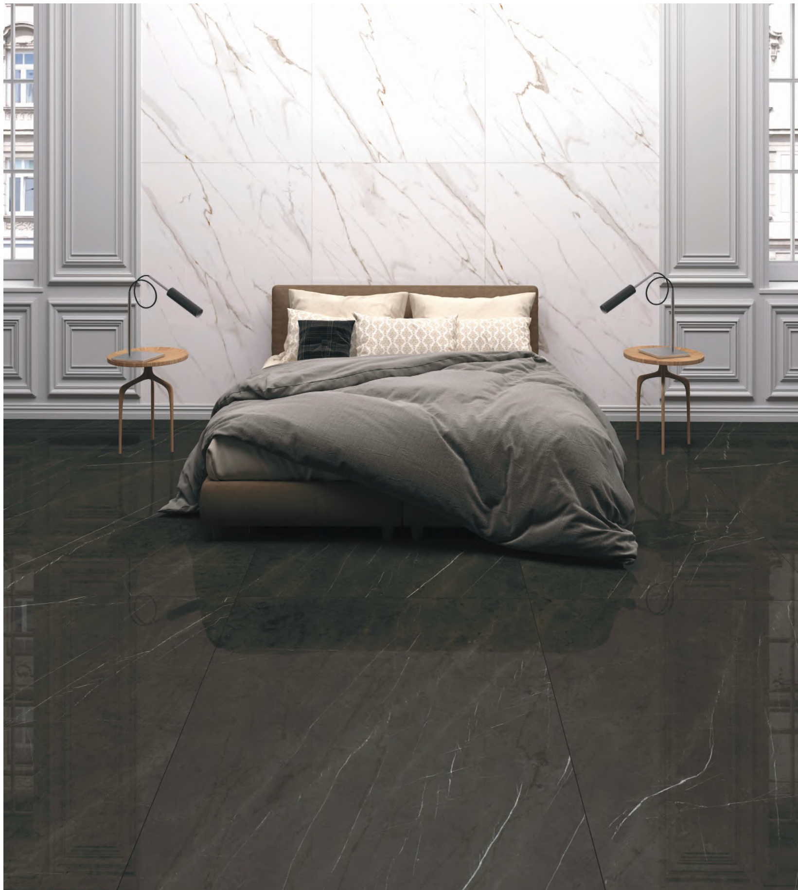
Preview Shown: SUPER GLOSS PIETRA MARBLE BLACK & PGVT CALACATTA MARBLE