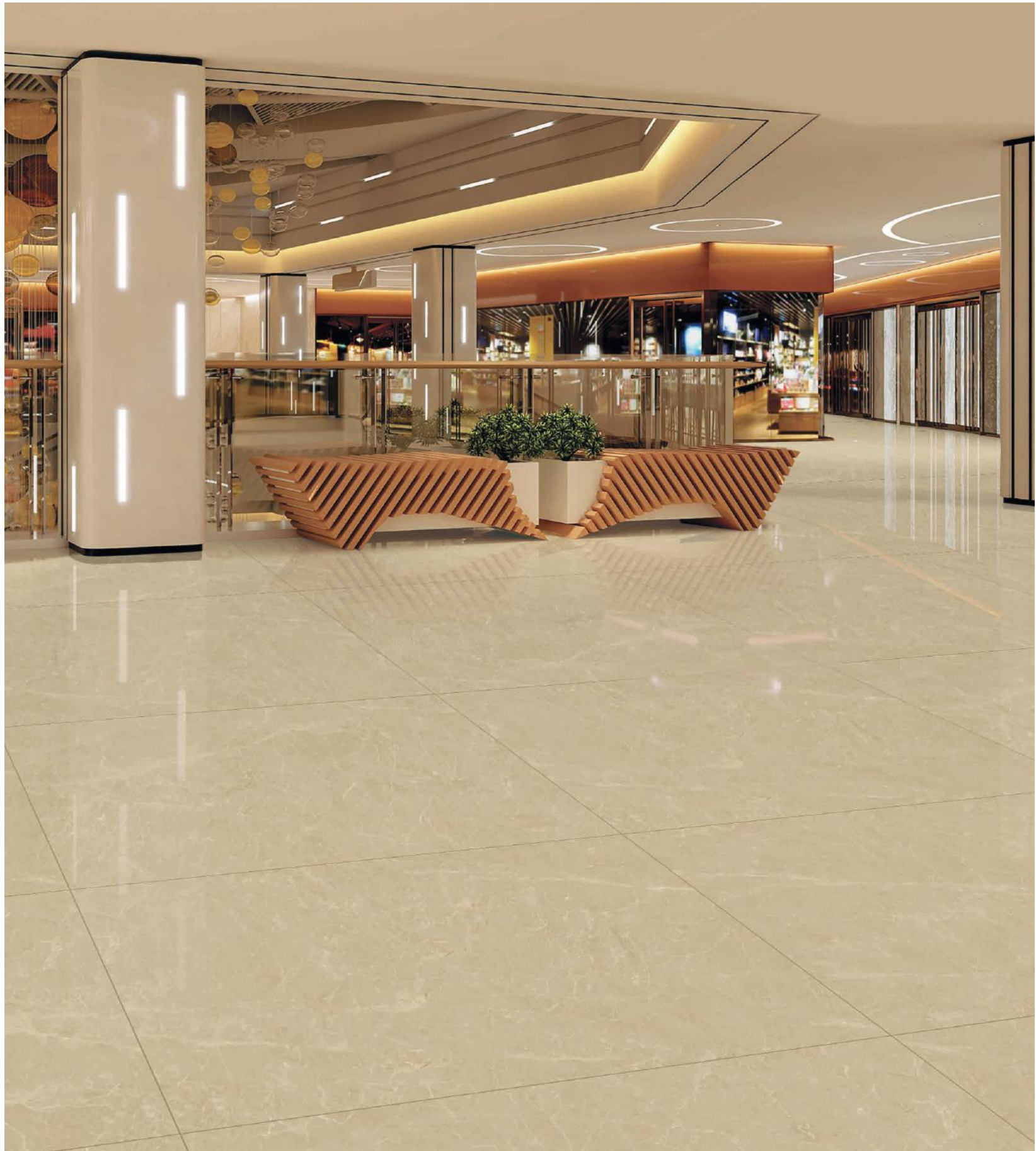
Preview Shown: PGVT MOON CREAMA