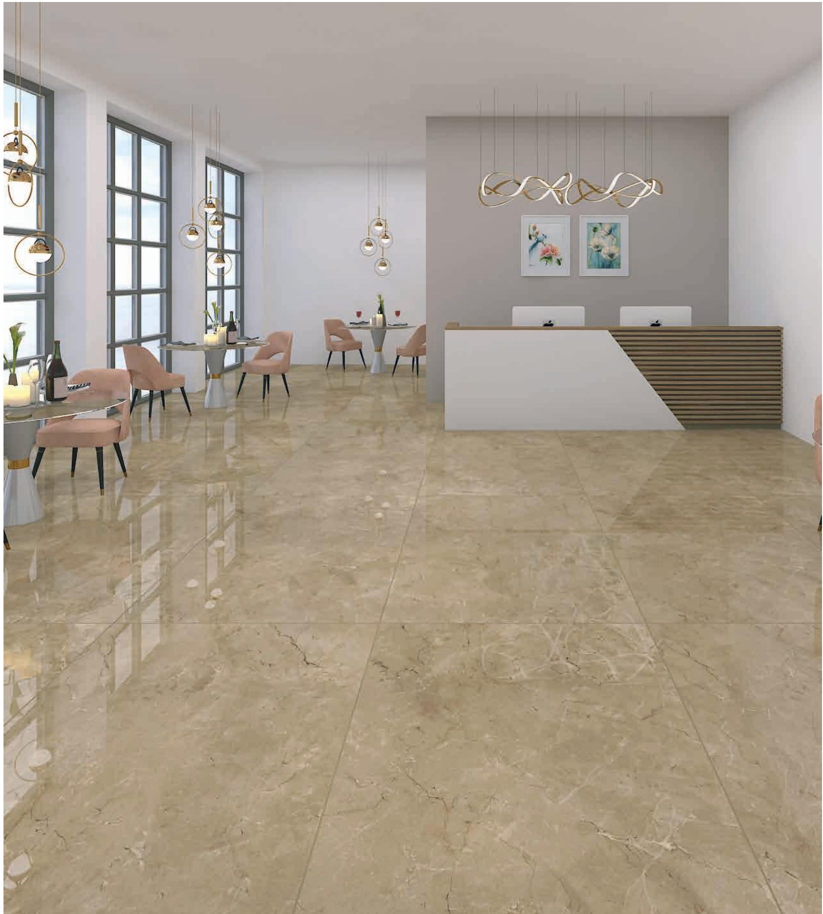
Preview Shown: SUPER GLOSS GRIGIO BEIGE