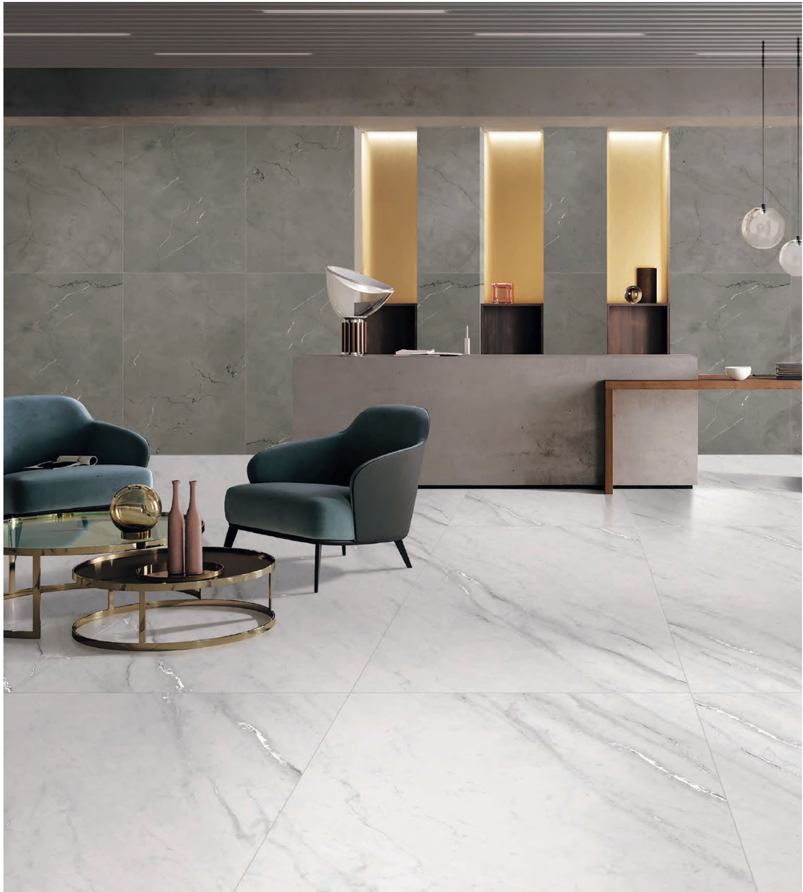
Preview Shown: CARVING CARRARA MARBLE & SUPER GLOSS ESSENZIALE GREY