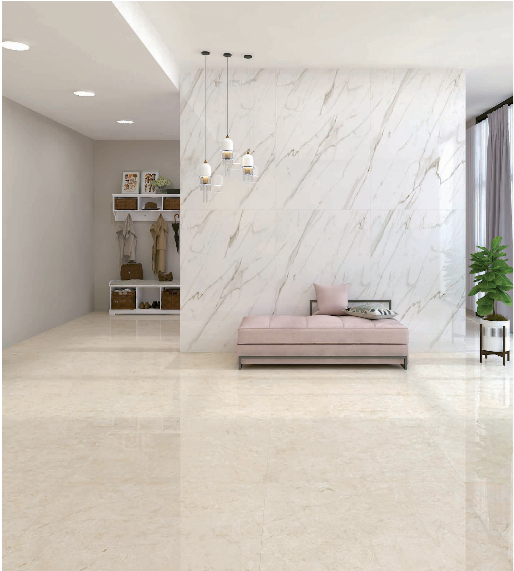
Preview Shown: PGVT CREAMA MARFIL & PGVT CALACATTA MARBLE