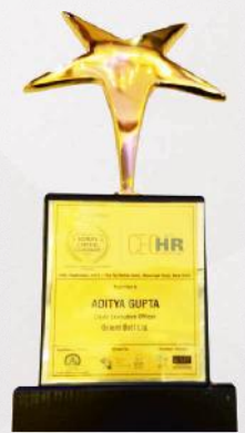
CEO with HR Orientation ZEE BUSINESS National Human Capital Leadership Congress & Awards