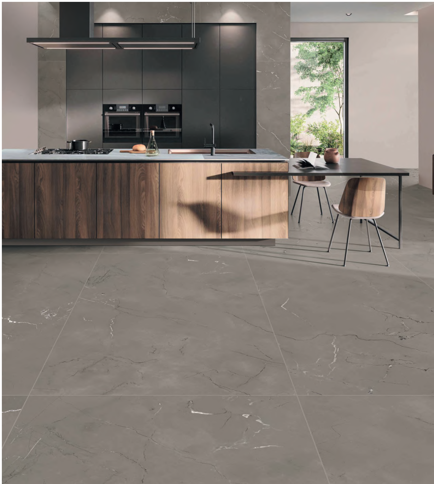
Preview Shown: SUPER GLOSS ESSENZIALE GREY