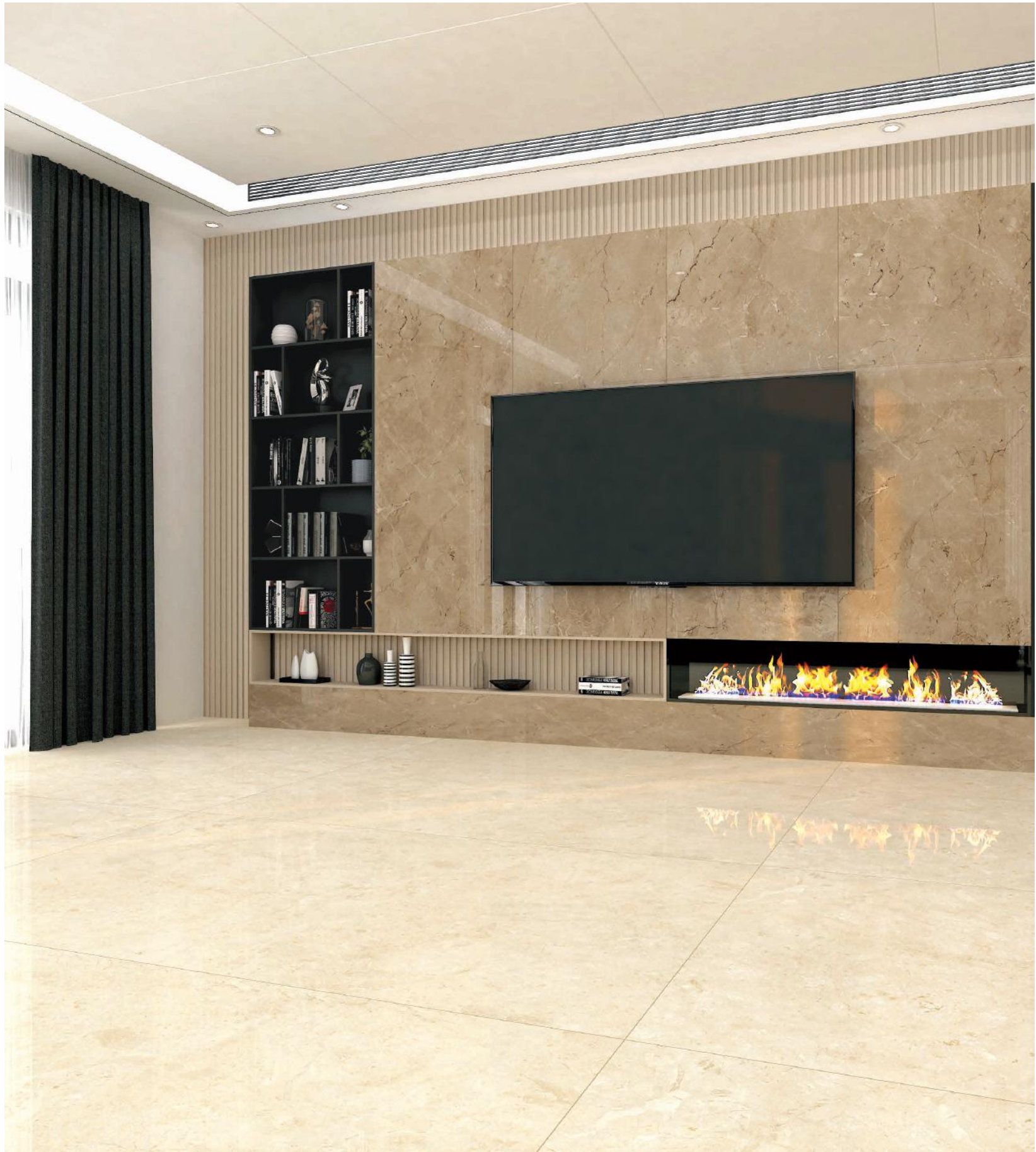
Preview Shown: PGVT DUOMO GRIS WHITE & SUPER GLOSS GRIGIO BEIGE