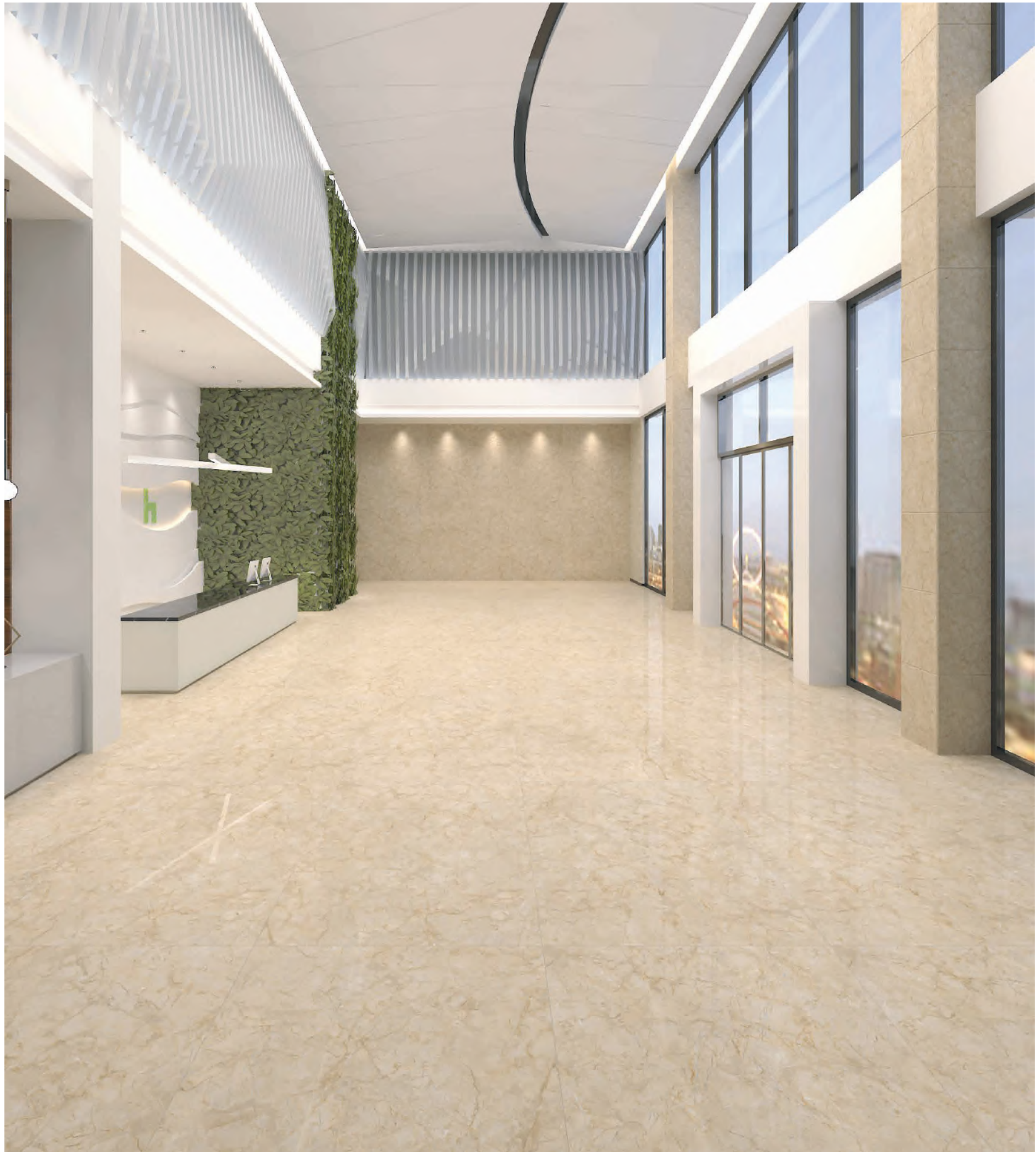
Preview Shown: SUPER GLOSS DYNASTY BEIGE MARBLE