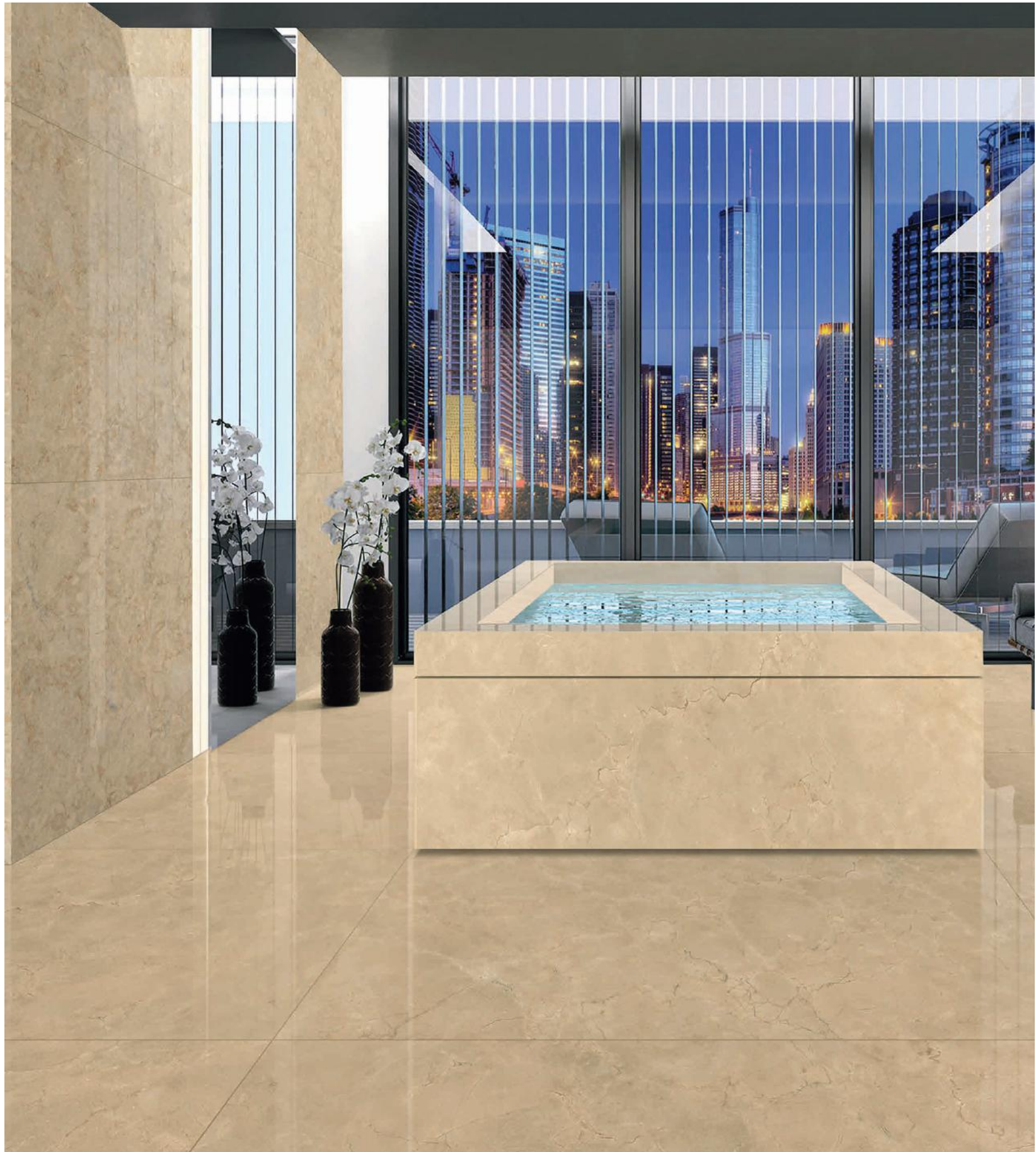
Preview Shown: PGVT MESSINA MARBLE CREAMA & SUPER GLOSS EMPRO BEIGE LT