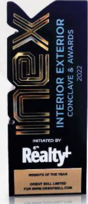
Website of The Year 2022 for www.orientbell.com (India's construction & design industry)