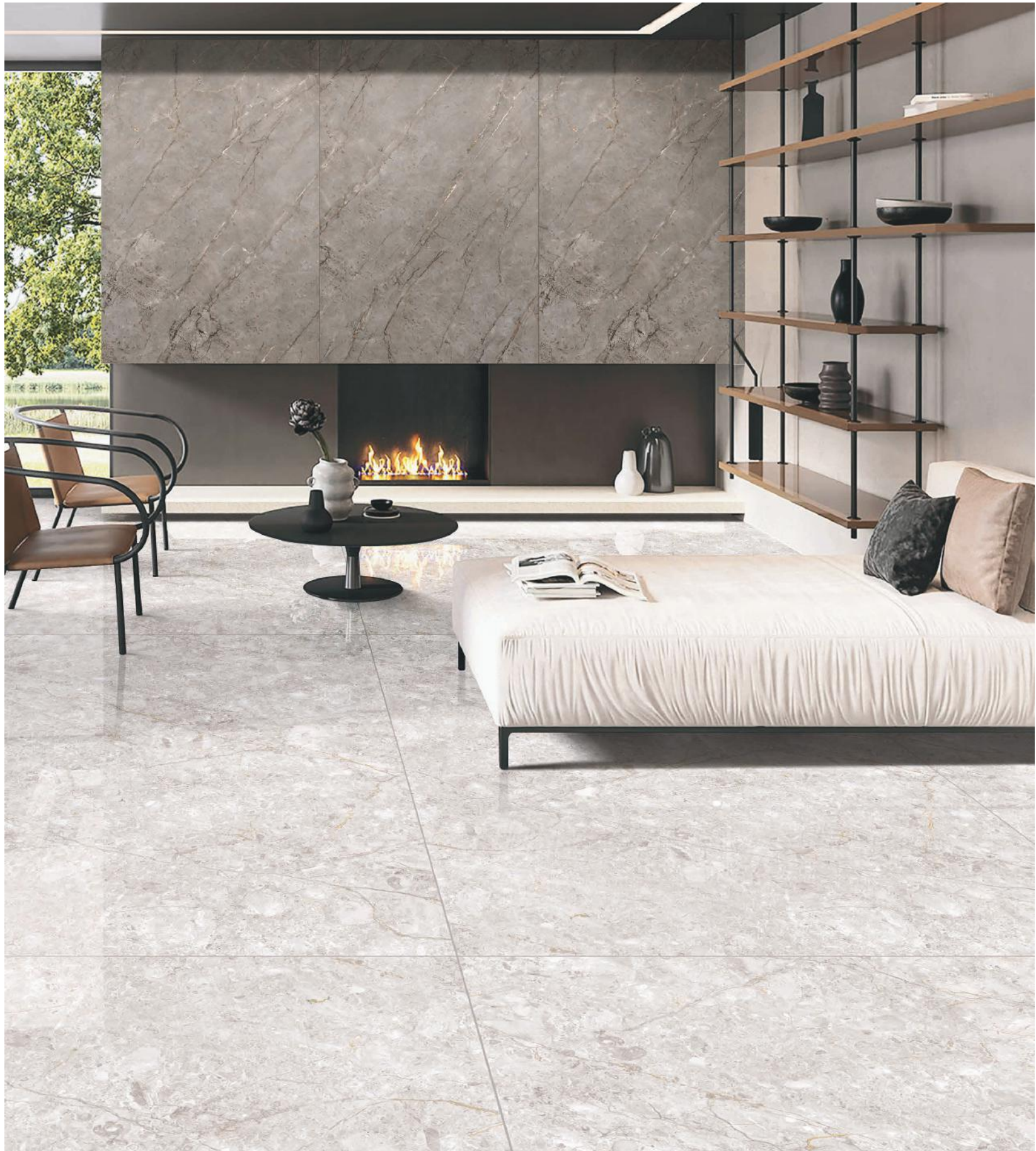
Preview Shown: SUPER GLOSS TUNDRA GREY & CARVING SONATA MARBLE GREY